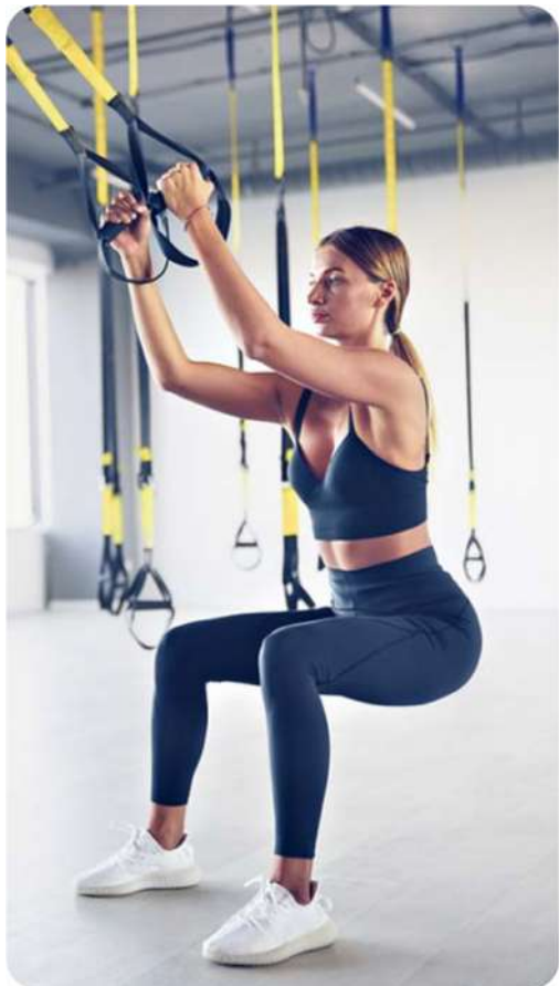
Below Photo: TRX® Demonstration